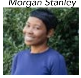
Partner of Franklin Morgan Private Equity Fund