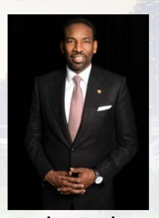
Andre Dickens 61ST MAYOR OF ATLANTA, GEORGIA